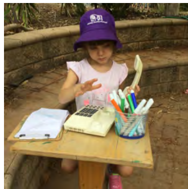
EYLF Outcome 5 - Children are effective communicators.