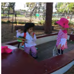
Connections with nature