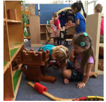
EYLF Outcome 3 - Children have a strong sense of wellbeing.