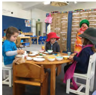
EYLF Outcome 1 - Children have a strong sense of identity