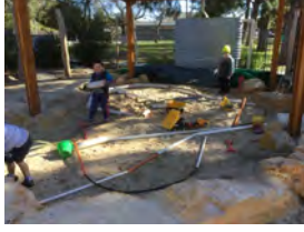
EYLF Outcome 4 Children are confident & involved learners