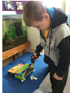
Exploring hot glue guns and wire in the making table for expressing our ideas